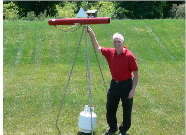
Figure 3. Bird bangers create an irritating noise for birds. Operate them under best management practices to avoid creating a noise nuisance for neighbouring homes.