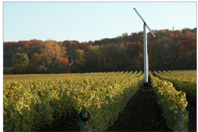
Figure 1. Wind machines are used worldwide to protect grapes, tender fruit and other crops against cold injury.

It is unrealistic to expect to be able to eliminate all noise produced on farms, but when noise issues escalate between a producer and a neighbour and cannot be solved locally, the Normal Farm Practices Protection Board — a quasi-judicial board appointed by the provincial government — may get involved.