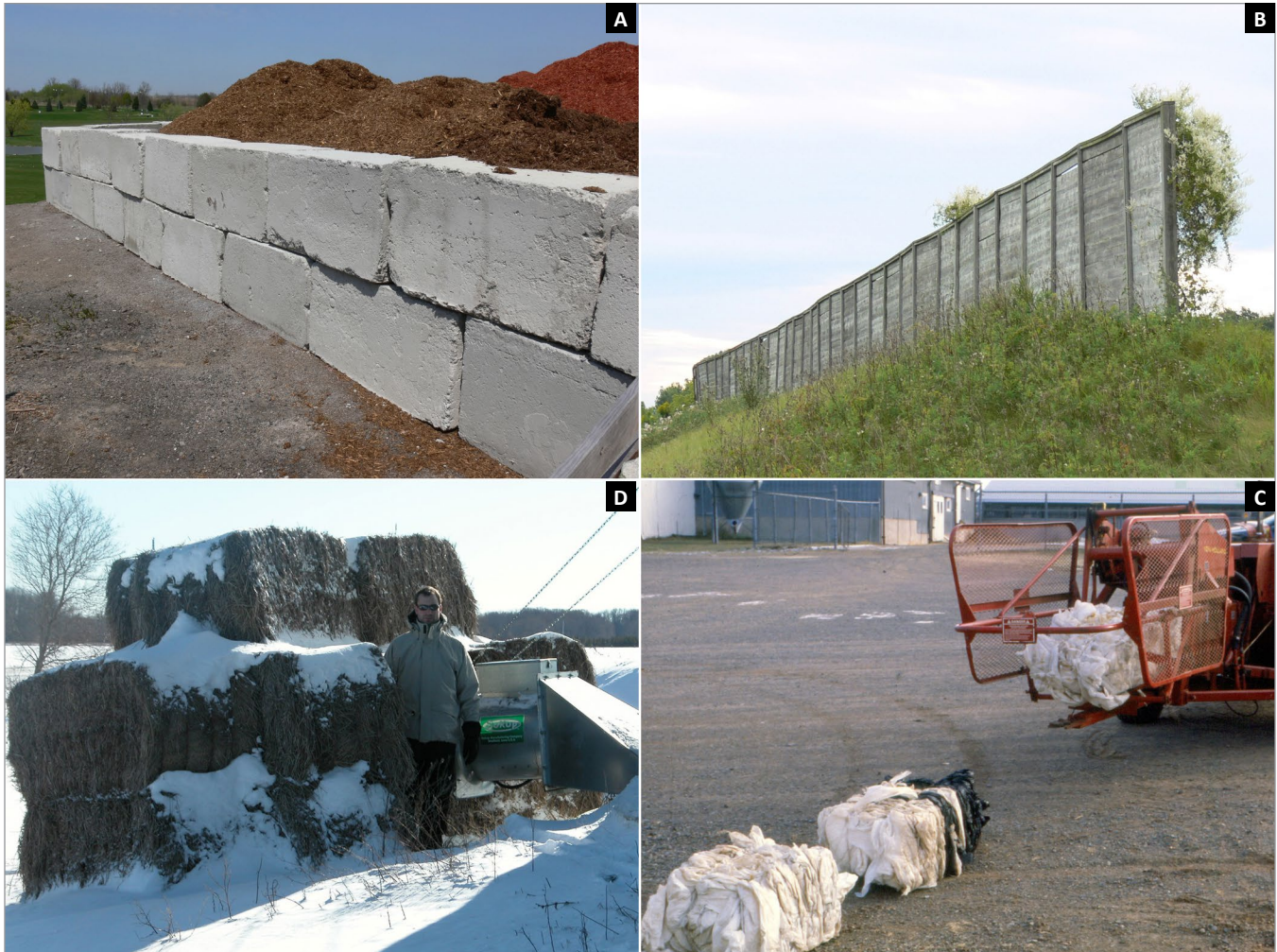
Figure 7. Some farm materials can be used as combination sound absorbers and sound barriers.