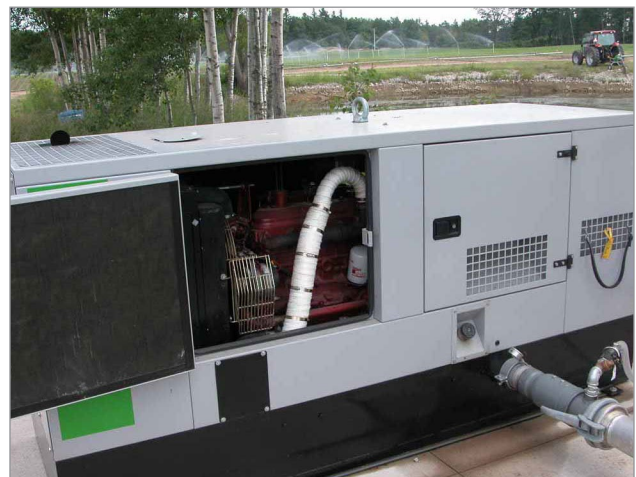
Figure 4. Sound is reduced from internal combustion engines on stationary irrigation pump equipment when it is covered with a special housing designed for that purpose.