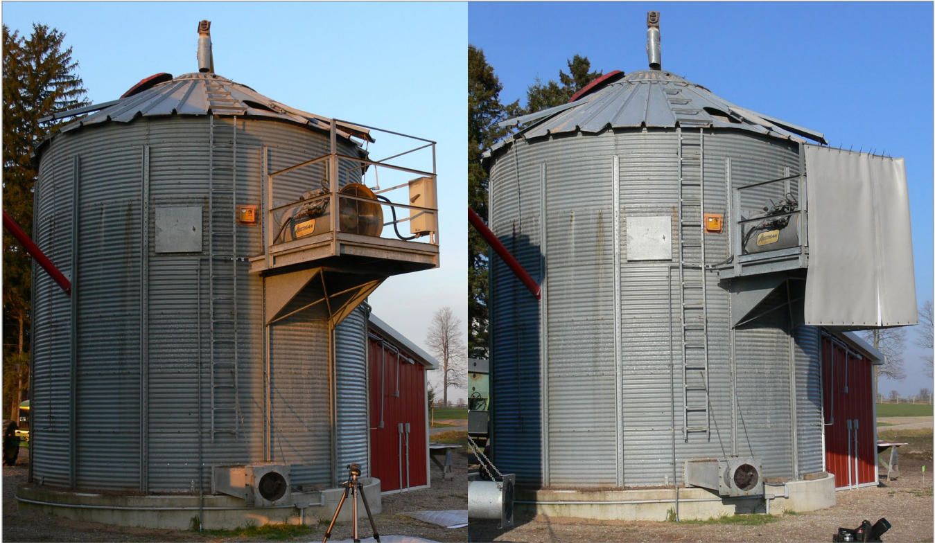
Figure 5. This heavy, flexible, weather- and heat-resistant sound blanket panel was installed to reduce grain dryer sound levels for neighbours. Three panels 1.2 m x 2.4 m x 25 mm (4 ft x 8 ft x 1 in.) thick, weighing 36 kg each, were joined by Velcro® strips and hung with grommets and heavy plastic ties.