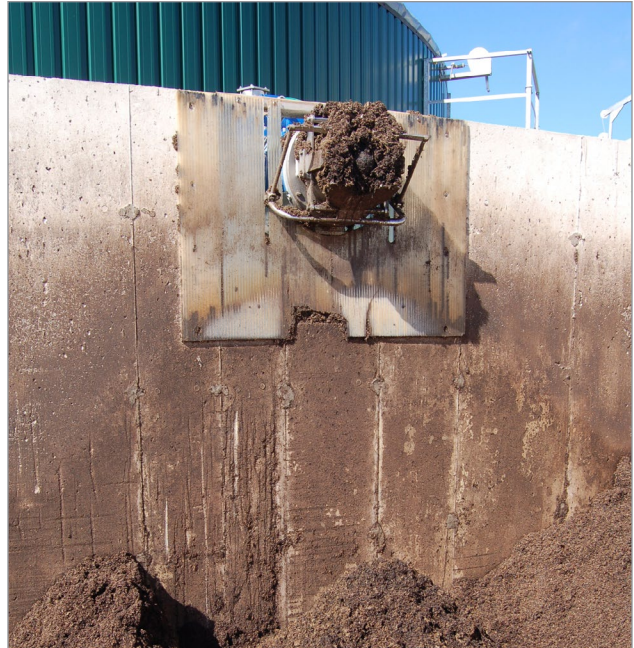
Figure 7. A manure separator connected to the anaerobic digester used to separate the solid fraction of digestate.