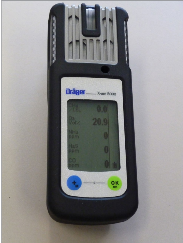
Figure 8. A personal hazardous gas monitor, which triggers an audible and visible alarm when the concentration of a gas goes beyond the safe threshold.