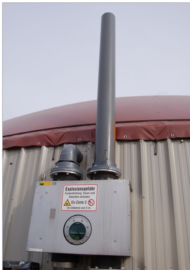
Figure 4. A freeze-proof over-under pressure relief valve installed on an anaerobic digester in Ontario.

Operators may have to remove the inflatable gas storage membrane or cover to repair equipment inside the anaerobic digester, during certain maintenance procedures. It is essential that operators follow the safety procedures learned in their training due to the hazards encountered.