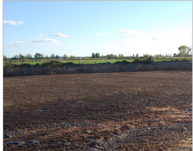
Figure 6. An earthen permanent digestate storage that resembles common permanent liquid manure storages used on dairy farms.