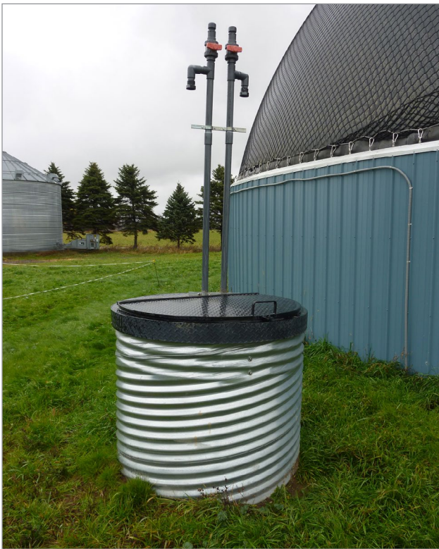
Figure 5. Access point to the condensation trap where the moisture removed from the biogas is collected.

In most agricultural biogas systems, moisture in the biogas is removed by passing it through an underground network of cooling pipes. The moisture cools and condenses, and is collected at the lowest point in a structure, called a condensation trap (Figure 5). The trap has a high probability of containing H 2 S, other hazardous gases and low levels of oxygen. Access to this structure must be restricted, as the condensation trap is considered a confined space.