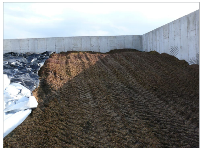
Figure 3. A horizontal concrete silo used to store drier off-farm materials such as corn husks and grape pumice.

Dry off-farm materials, typically greater than 30% dry matter, are commonly ensiled on the farm in partially enclosed horizontal silos (Figure 3). H 2 S and NO 2 can be trapped inside the materials and released when handled or mixed. Also, the pile can heat up if left unattended for an extended period of time.