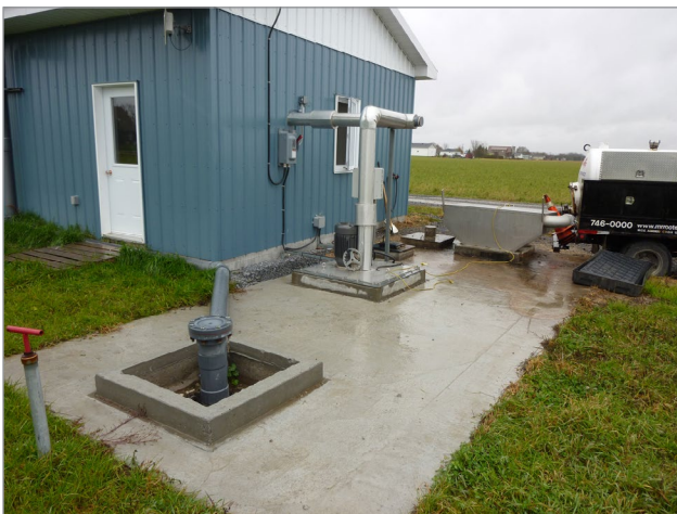
Figure 2. An in-ground co-substrate input tank where liquid off-farm materials such as fats, oils and grease are stored temporarily.

Using off-farm materials to boost biogas production is a popular practice for agricultural biogas systems. Materials such as grease from restaurants and residues from agri-food processing are co-digested with livestock manure generated on the farm. If the dry matter content (DM) of these off-farm materials is less than 18% or is easily pumped, they must be stored in a sealed tank called a co-substrate input tank (Figure 2). Gas production by active bacteria can accumulate inside the sealed co-substrate tank.