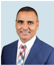
Parm Gill Minister of Red Tape Reduction

Reducing red tape is about streamlining regulations so entrepreneurs can grow their businesses. It's about cutting unnecessary fees and making paperwork simpler, so people spend less time filling out forms or tangled in complex government processes.