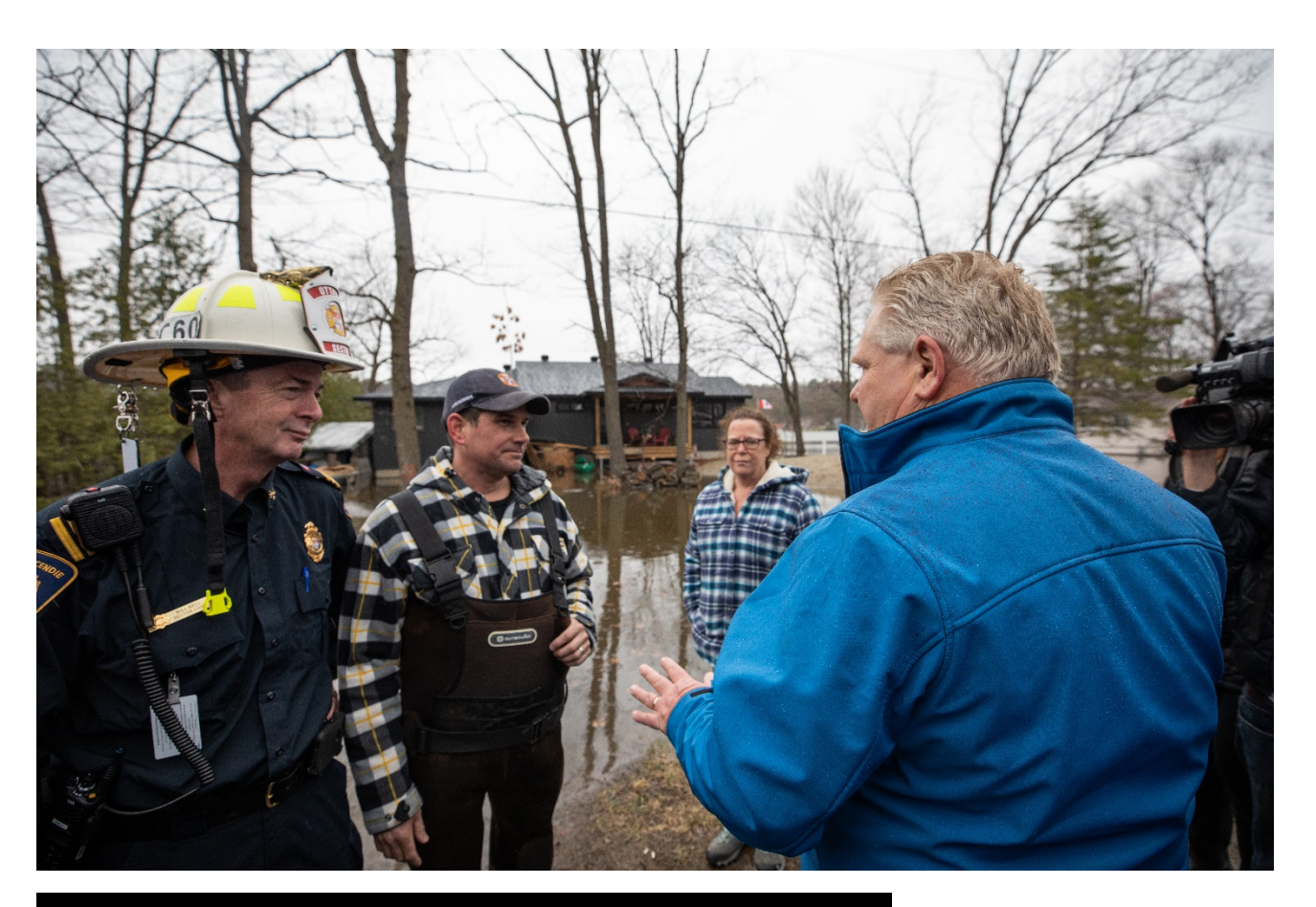
Premier Doug Ford tours flood impacted area in Spring 2019

While insurable payouts averaged $400 million per year from 1983 to 2008 in Canada, they exceeded $1 billion per year for eight of the last nine years, leading up to 2017. Nationally, spending on flood-related damage accounts for 75% of all weather-related expenditures.