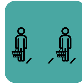
Limit number of customers