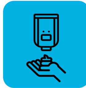
Supply hand sanitizer for delivery people and customers