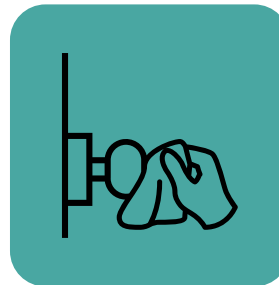
Clean commonly touched surfaces