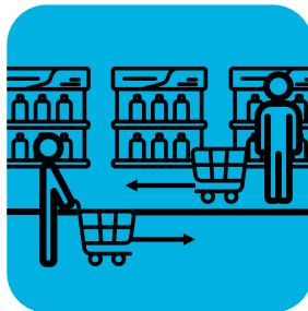
Mark floors to space customers