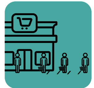
Assign staff to maintain distancing