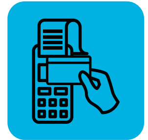
Minimize contact with customers