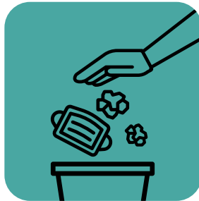
Provide safe place to throw out wipes, masks and gloves