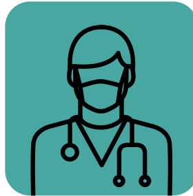
Don't share equipment where possible