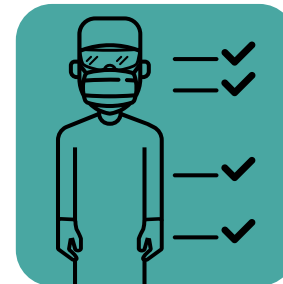
Train staff on proper use of personal protective equipment