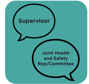
Voice your concerns