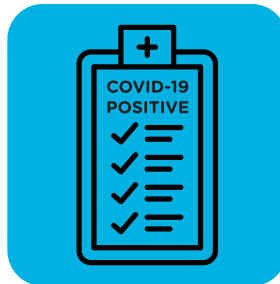
Report probable and confirmed cases to your supervisor