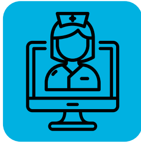
Use virtual or phone appointments where possible