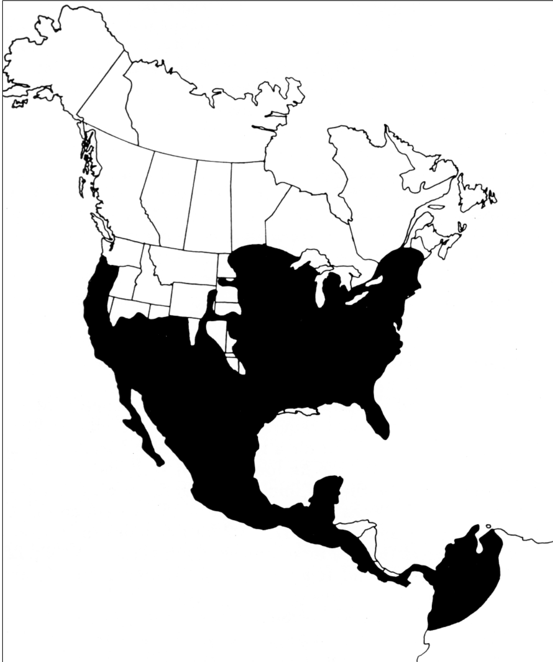
Figure 1. Global range of the Grey Fox (Judge and Haviernick 2002).