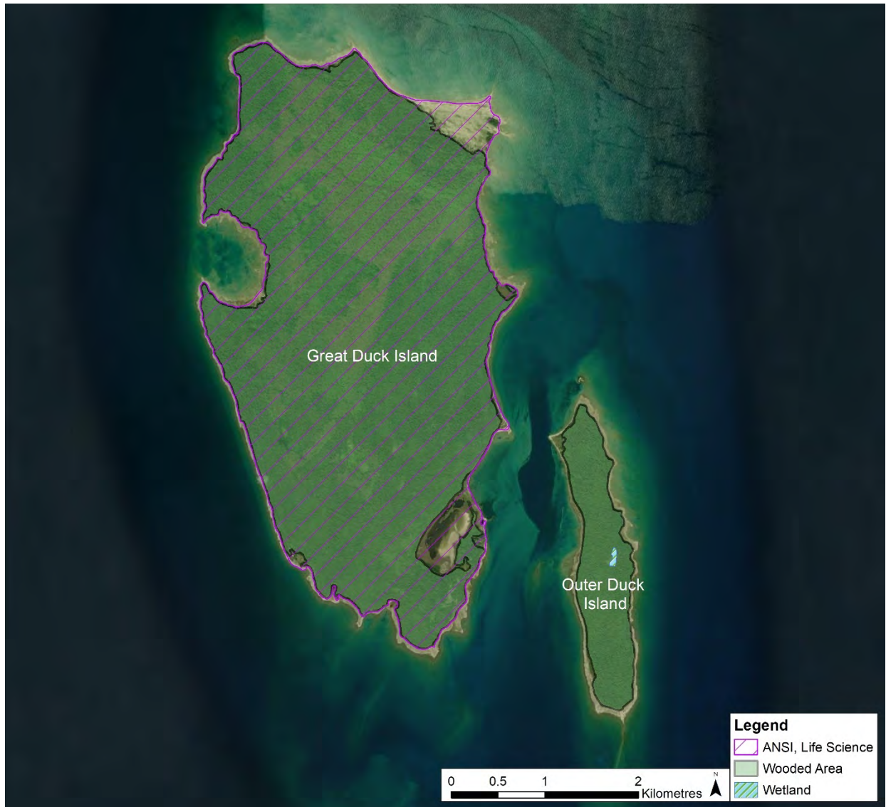
Figure 3. Great Duck Island Provincially Significant Life Science Area of Natural or Scientific Interest (NHIC 2021a).

Ontario's Endangered Species Act, 2007 (ESA) provides science-based assessment, automatic species protection, and habitat protection, in order to protect Species at Risk in Ontario. Unauthorized destruction of Species at Risk and their habitats constitutes a contravention of the ESA.