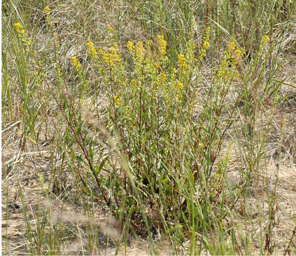
Figure 1. Gillman's Goldenrod.