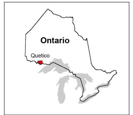
FIGURE 2 - PLAN AREA