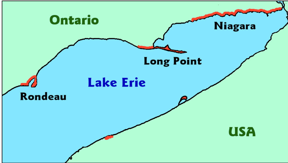
Figure 3. Locations around Lake Erie where Fowler's Toad populations currently exist. (Oldham and Weller 2000).