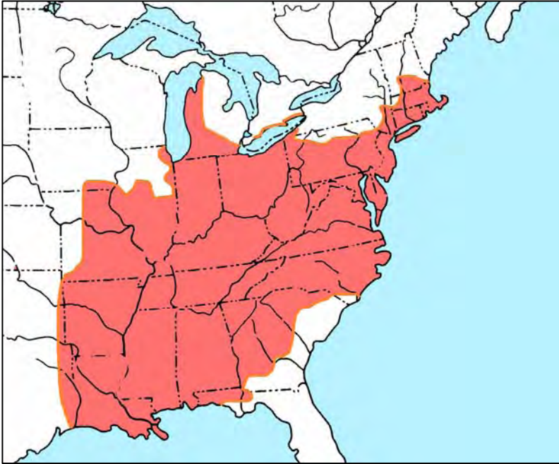
Figure 1. Range of Fowler's Toad in North America (Conant and Collins 1991).

The species is not listed as a species of concern federally in the United States or in any of the states adjacent to Ontario. However, populations along the south shore of Lake Erie in Pennsylvania and Ohio may be imperilled. These populations are disjunct from the species' primary range and recent evidence indicates that they are related to, and possibly derived from, Canadian populations on the north shore of the lake, and are subject to the same threats (Smith 2004, Smith and Green 2004).