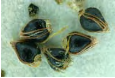
Figure 1: Achenes of Bent Spike-rush.