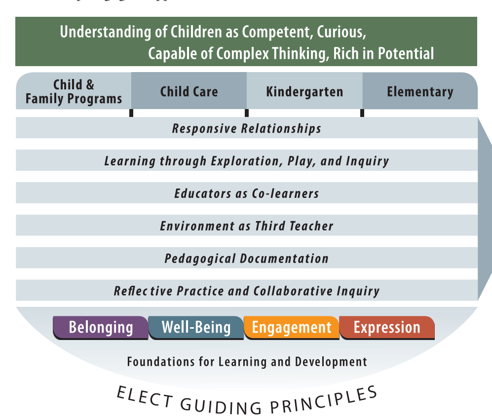
Figure 4. Pedagogical approaches to support the key foundations for learning are common across settings and ages for a continuum of learning.

to more seamless programs for children, families, and all learners along a continuum of learning and development. This vision is illustrated below.