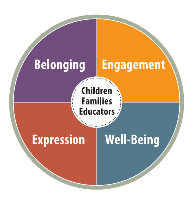
Figure 2. The four foundations ensure optimal learning and development. These foundations inform the goals for children and expectations for programs.