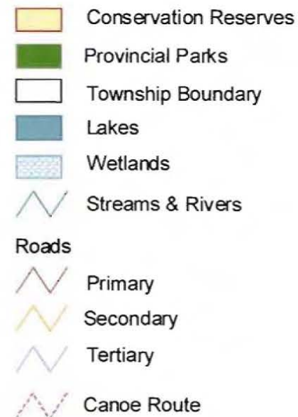
Figure 1 Whitefish and East Whitefish Lakes Sandy Till Uplands Conservation Reserve C1602 Map Overview