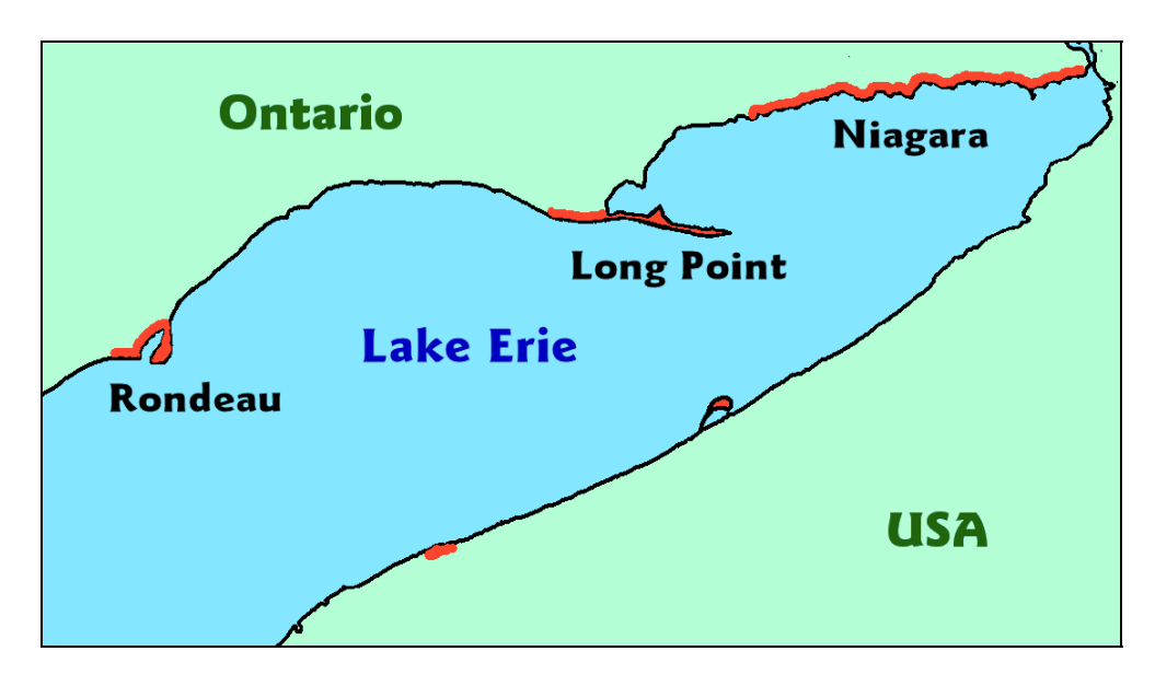
Figure 3. Locations around Lake Erie where Fowler's Toad populations currently exist. (Oldham and Weller 2000).