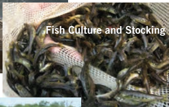
Fish Culture and Stocking